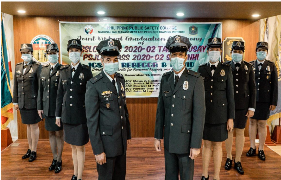
BJMP conducts first Joint Nationwide Virtual Graduation