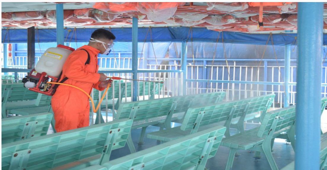
from the Municipality of San Andres