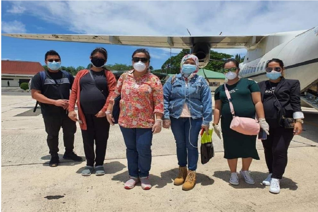
Attendees sign the pledge in implementing the Disiplina Muna advocacy campaign.