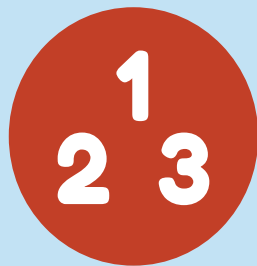
Set in order